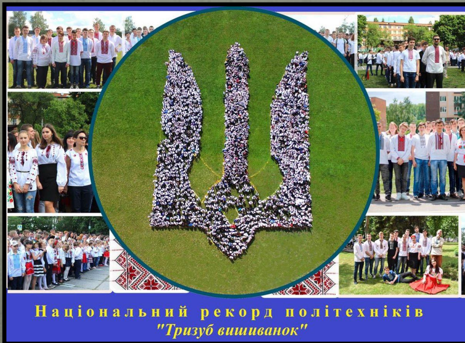
Національний рекорд політехніків "Тризуб вишиванок"

Khmelnitsky Polytechnics are real patriots. After conducting the flashmobe "Trident embroidery", we twice, in 2017 and 2018, established the records of Ukraine and were listed in the book of records of Ukraine.