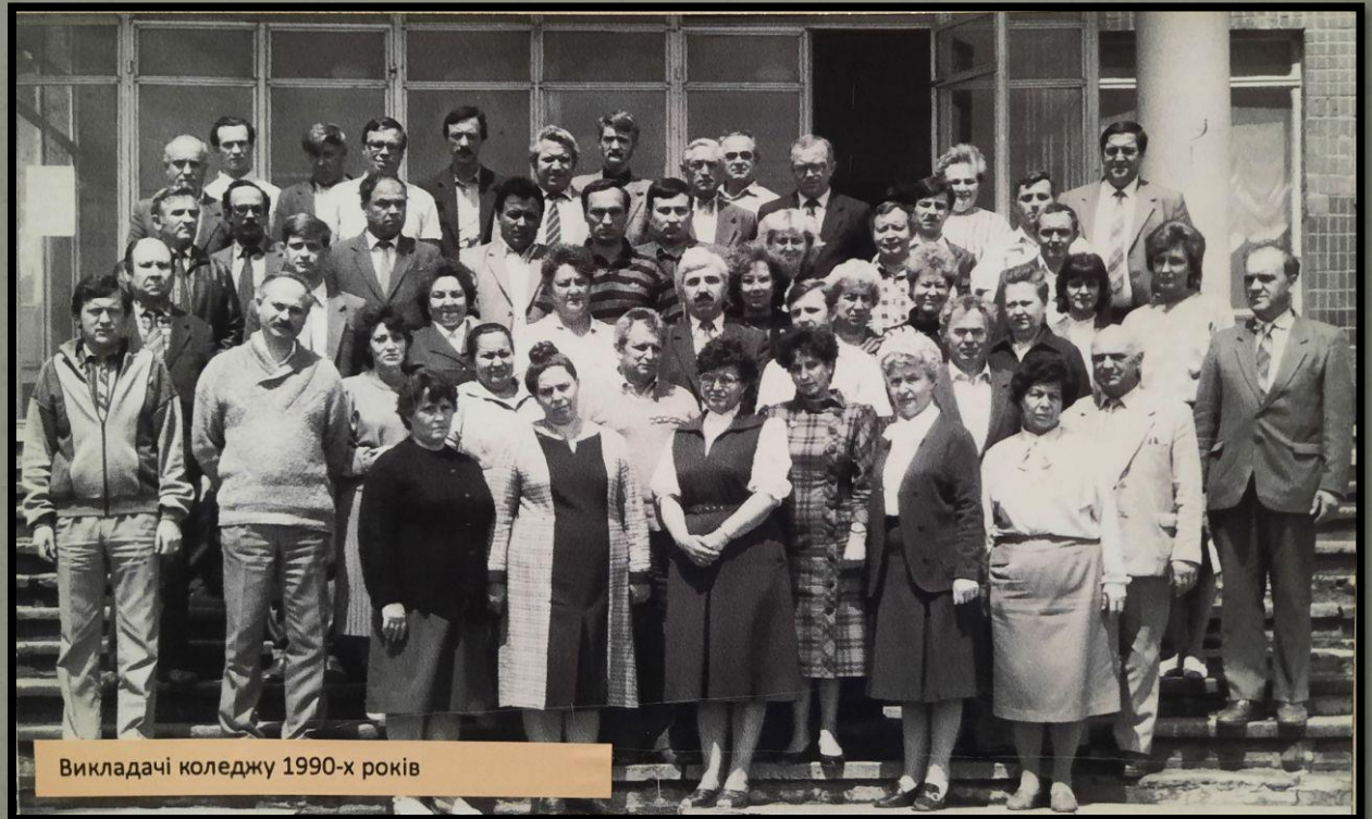
College teachers of the 1990s