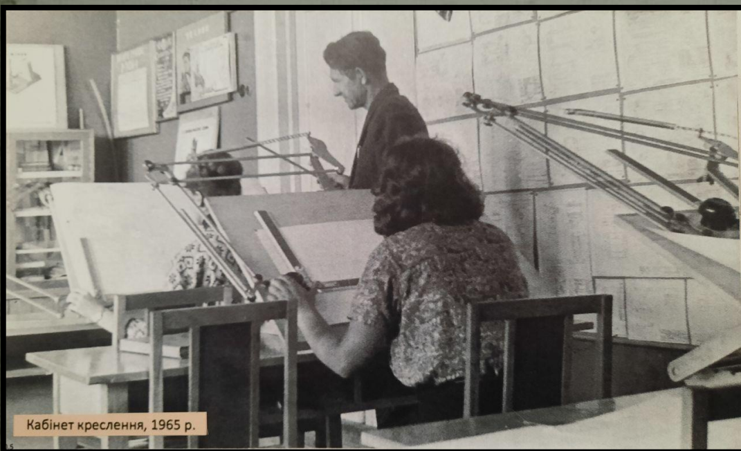
Кабинет креслення, 1965 р.