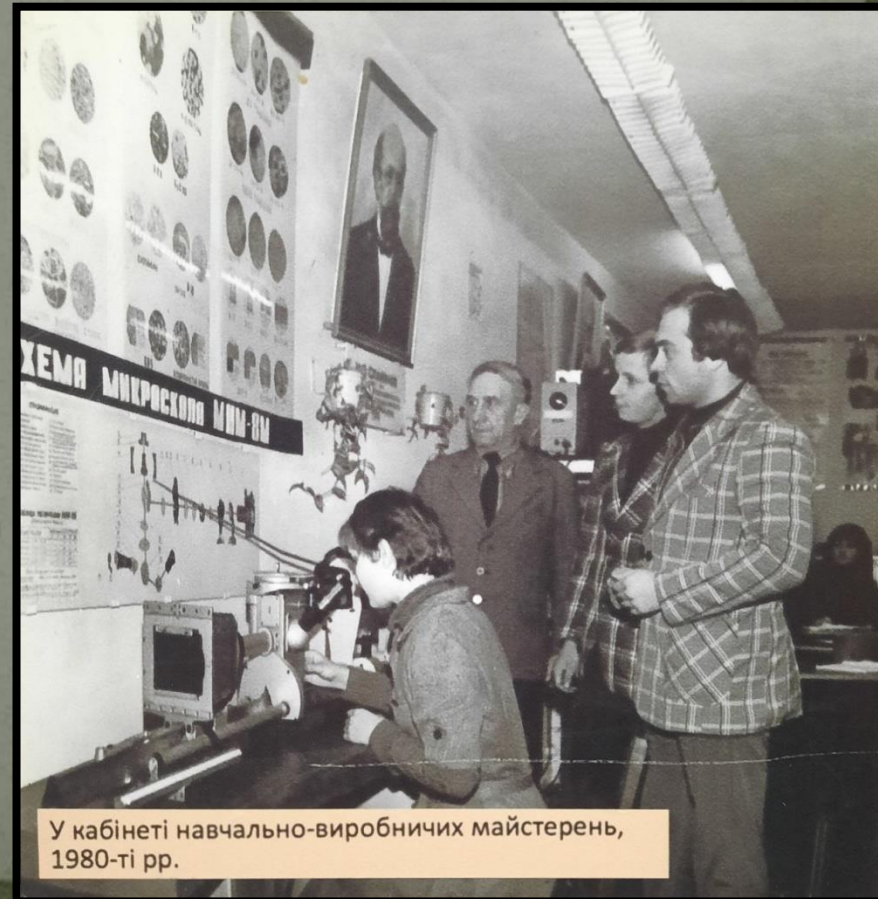
У кабінеті навчально-виробничих майстерень, 1980-ті рр.

In the cabinet of training and production workshops, 1980