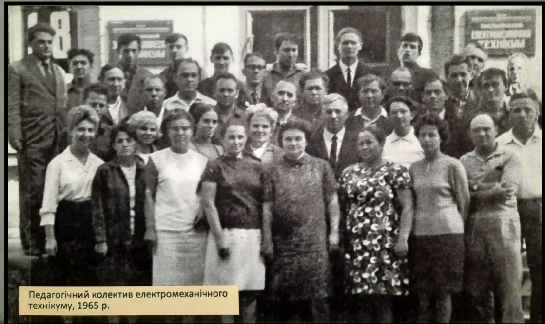
Педагогічний колектив електромеханічного технікуму, 1965 р.

Pedagogical staff of the electromechanical technical school, 1965